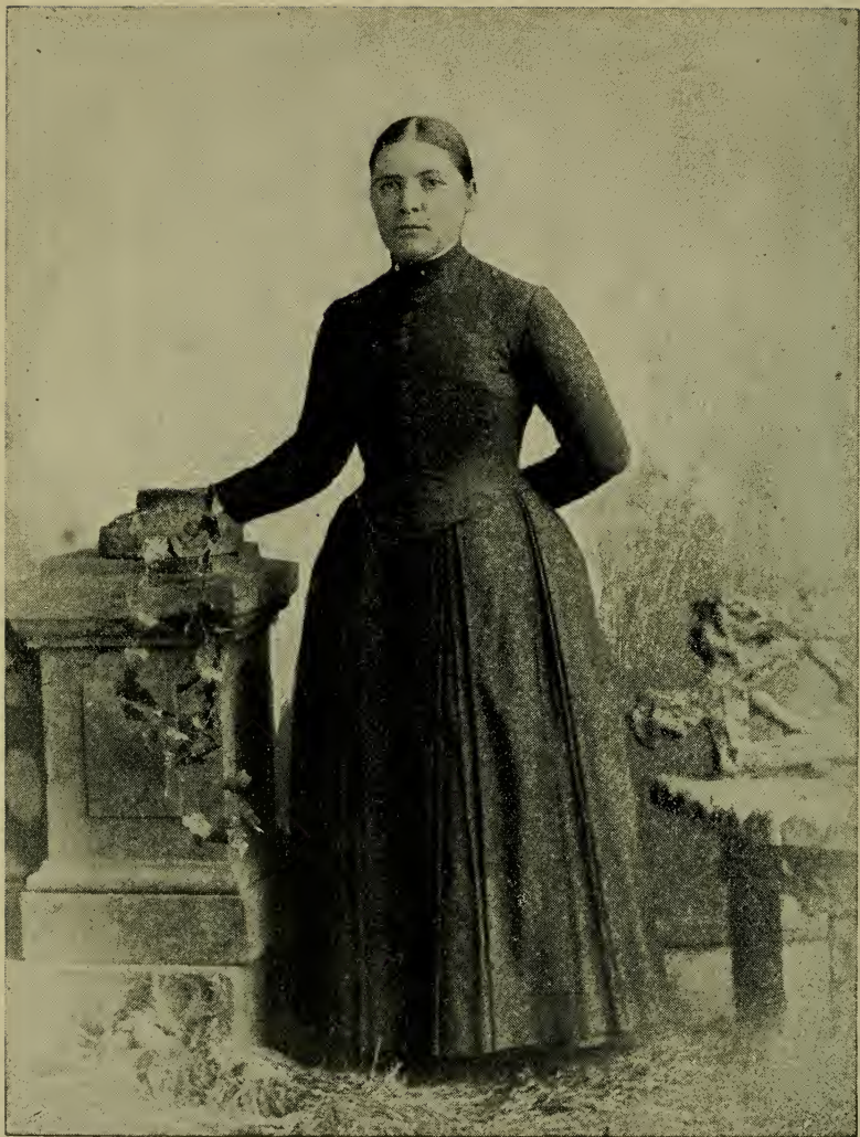
A NURSE DEACONESS.